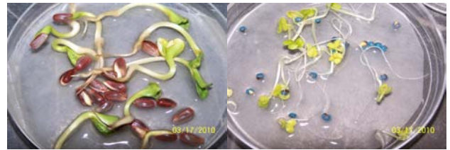
Oil seed germination under tap (left) and 150 me NaCl saline water (right)

This research on water stress tolerance of salicornia is especially significant. This plant species is native to estuaries and for this reason, it can tolerate salinity up to sea water. However, it is generally considered that it requires a lot of water and wet soils. Knowledge of plant physiology points to the possibility that this plant species can actually be drought-tolerant as the plant takes in salts, more water is taken up to dilute salt concentration inside root tissue. Particular significance is that if this hypothesis is true, this estuary plant can be grown in upland or coastal desert regions using conventional farming systems.