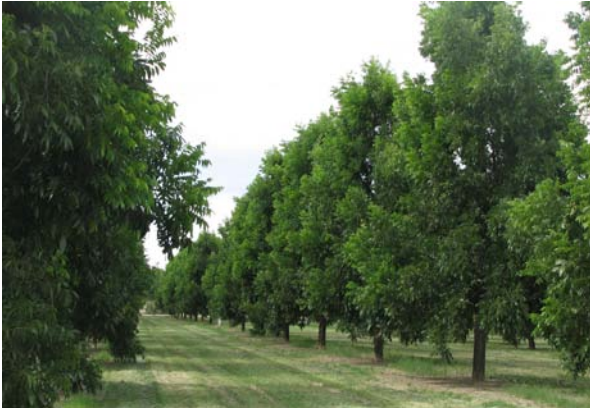
Pecan Orchard in El Paso County, Texas