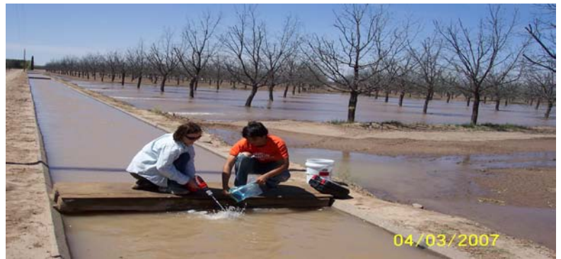
Organic polymer being mixed and applied with irrigation water