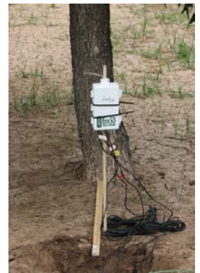
Example of a soil moisture sensor installed in the field

Results indicated that while all three sensors were successful in following the general trends of soil moisture conditions during the growing season, accuracy of measurements for ECH 2 O 5TE was better than watermark and tensiometers. Sensors data showed that in all irrigation events the soil moisture content was well above the threshold level, indicating that excess water was applied by conventional method. Results to date indicate that at least one-irrigation could be saved per season by irrigating fields based on soil moisture data. With an estimated 9,000 acres under irrigated pecan production in El Paso County Water Improvement District #1, about 3,000 acre feet of freshwater can be saved. The results of this study can help in improving water use efficiency in pecan orchards, conserve precious freshwater resources and increase farm profits.