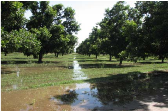
Flood irrigation is common in the region due to soil salinity

Support provided by: USDA-NIFA Rio Grande Basin Initiative through Texas Water Resources Institute and Texas Agrilife Research in collaboration with the local pecan grower Mr. Art Ivey