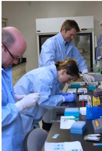
An international technology transfer workshop was held at the Texas AgriLife Research Center at El Paso

The first phase of this research involved method development and was completed under Water Research Foundation Project 4099. The overall objective of Project 4099 was to develop a simple and reliable method for genotyping single Cryptosporidium oocysts recovered from water quality testing laboratories with minimal or no molecular biology experience. The second phase of research is currently being conducted under Water Research Foundation Project 4284. Project 4284 includes an international technology transfer workshop and international