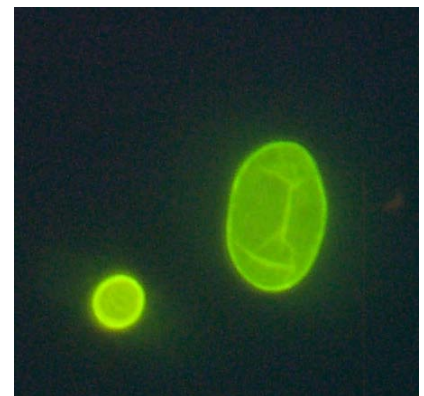
Cryptosporidium oocyst (left) and Giardia cyst (right) under epifluorescent microscopy