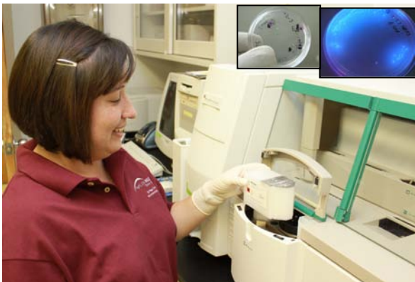
RiboPrint genetic fingerprinting of E. coli bacteria at Texas AgriLife Research Center, El Paso, Texas. Insets, E. coli isolated from water and fecal samples