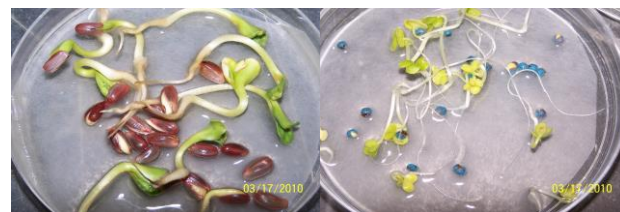
Oil seed germination under tap (left) and 150 me NaCl saline water (right)

This research on water stress tolerance of salicornia is especially significant. This plant species is native to estuaries and for this reason, it can tolerate salinity up to sea water. However, it is generally considered that it requires a lot of water and wet soils. Knowledge of plant physiology points to the possibility that this plant species can actually be drought-tolerant as the plant takes in salts, more water is taken up to dilute salt concentration inside root tissue. Particular significance is that if this hypothesis is true, this estuary plant can be grown in upland or coastal desert regions using conventional farming systems.