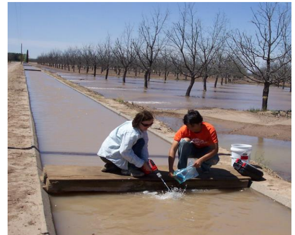
Organic polymer being mixed and applied with irrigation water

reduced salinity (see figure) and sodicity in top two feet of soil by 41% and 56%, respectively, compared to the control area that did not receive polymer application. As evidence of improved soil conditions, pecan nut yields increased by 34% in the polymer treated area over the control area. Study results suggested that polymer application can help in effective utilization of native Ca sources to counter sodicity and facilitate salt leaching. Polymer application maintained the improved permeability conditions created by land preparation activity prior to irrigation for longer time compared to control. These effects reduce the need for frequent deep tillage or sub-soiling to improve soil permeability and consequently reduce the cost of production and increase profits for growers in the region.