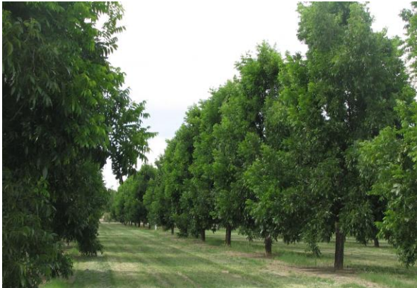
Pecan Orchard in El Paso County, Texas